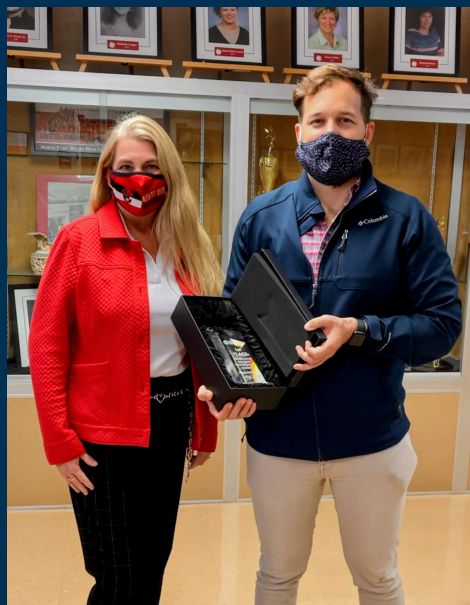
2019-2020 High School Voter Registration Challenge Winners receiving their trophies. Left: 1st place, North Fort Myers High School; top right: 2nd place, Lehigh Senior High School; bottom right: 3rd place, Mariner High School.

The 2020-2021 High School Voter Registration Challenge kicked off in September 2020 and ends February 26, 2021.